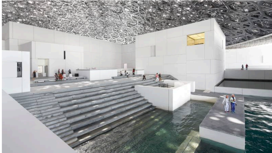
The Louvre Abu Dhabi Art Here 2023 exhibition is returning for the third year.

► The selected creatives will have their work showcased as part of the third Art Here exhibition at Louvre Abu Dhabi