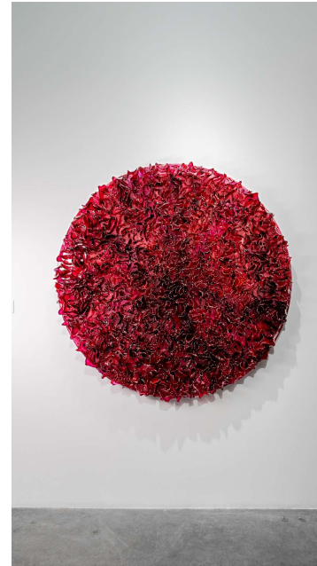
Red reef, 2023, Epoxy resin, ink, acrylic, 150x150x20 cm, Courtesy of Firetti Gallery, Dubai, UAE

Wahba's resonant ode to the resilience of womanhood was musically rendered in her debut solo exhibition, titled Translucent Threads of Life at Firetti Contemporary in Dubai. Each sculpture exhibited, laden with a collective, feminist aura, reconciled the rhythms of nature with the souls of womankind, reflecting their analogous strength and delicacy – a sculptural testament to the resilience of beauty, which gracefully endures and unfolds amidst adversity.