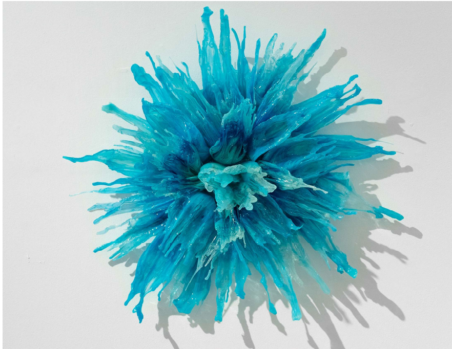
Wild beauty, 2022, Epoxy resin, ink, wood, 90x90x40 cm

Saudi Arabia- Egypt-UAE | Federica Falchi