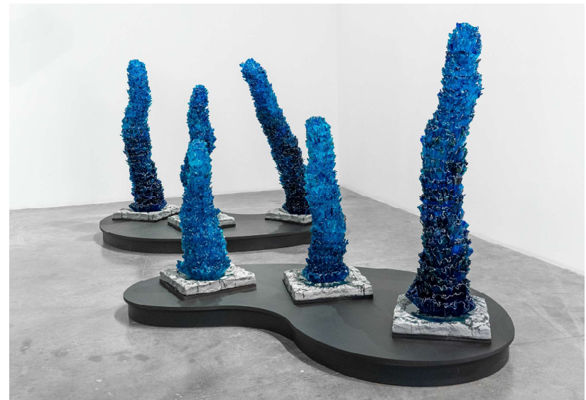
Harmony unbound, 2023, Epoxy resin, ink, acrylic & cement, Different sizes (82, 91, 108, 130)x40x40 cm, Courtesy of Firetti Gallery, Dubai, UAE