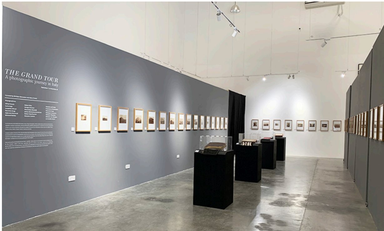
A view of the photographic exhibition.

Giorgio Sommer (1834 – 1914) was an Italian-German photographer. His catalogue included images from the Vatican Museums, the National Archaeological Museum of Naples, the Roman ruins in Pompeii, streets and architecture of Naples, Florence, Rome, Capri and Sicily. Gioacchino Altobelli (1814 – d. post 1878) was an Italian painter and photographer. Many of the Roman views he made were presented at the Universal Exposition in Paris in 1867.