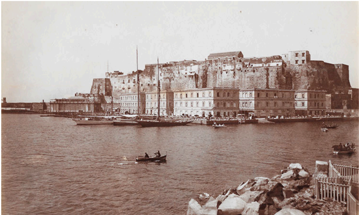
This was how Giacomo Brogi viewed Castel dell'Ovo, Naples, in 1885.

“Their journey took them through famous capitals such as London and Saint Petersburg, to the iconic cities of Italy, or the ancient ‘garden of the empire’”.