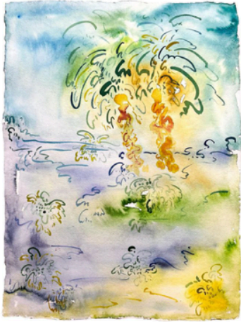
I Reminisce in Colours