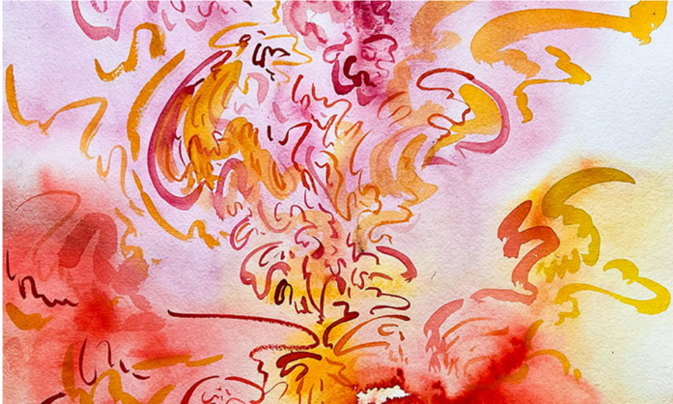
A work from the I Reminisce in Colours series.