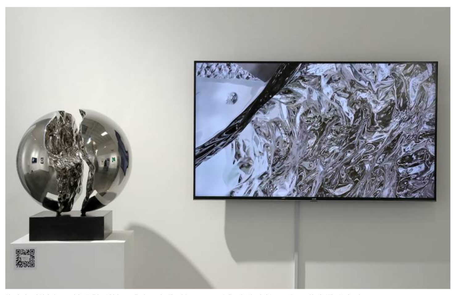
Physical and Digital artwork by Helidon Xhixha on display at the Firetti Contemporary Gallery in Alserkal Avenue.

▶ The experimental display considers the potential of mixing traditional and crypto art