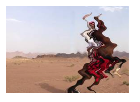
A new wave of NFT art is taking shape in the Gulf

The NFT art space has not quite followed this path, and Morrow Collective and Firetti Contemporary certainly are not the first to stray from it. By the time NFTs had their breakthrough moment in March with the $69 million sale of Beeple's Everydays – The First 5000 Days , Christie's, which handled the sale, had already set its sights on the crypto market. This week, it announced its first NFT auction in Asia.