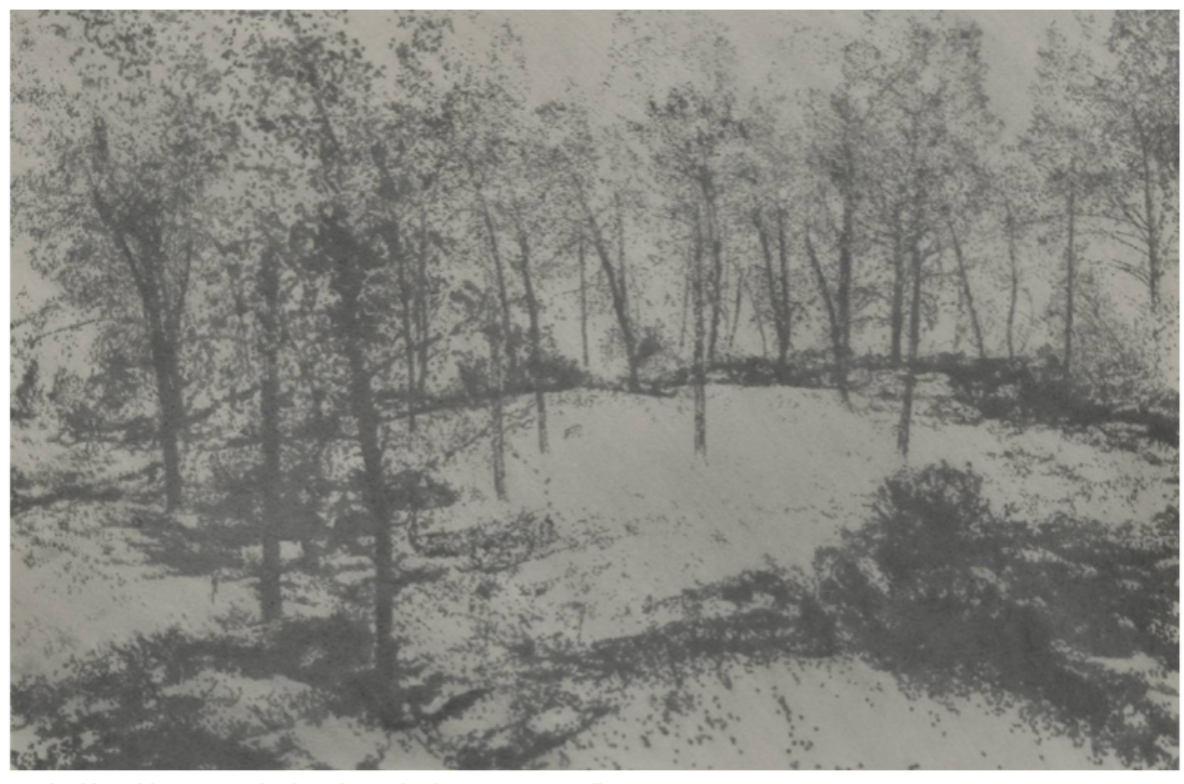
'Forest Fire I' (2022) by Sawsan Al Bahar.

The eight surrounding drawings examine another facet of this idea. Al Bahar's incredibly detailed works are formed from descriptions in her grandfather's memoir, such as a forest in Palestine or the school he attended.