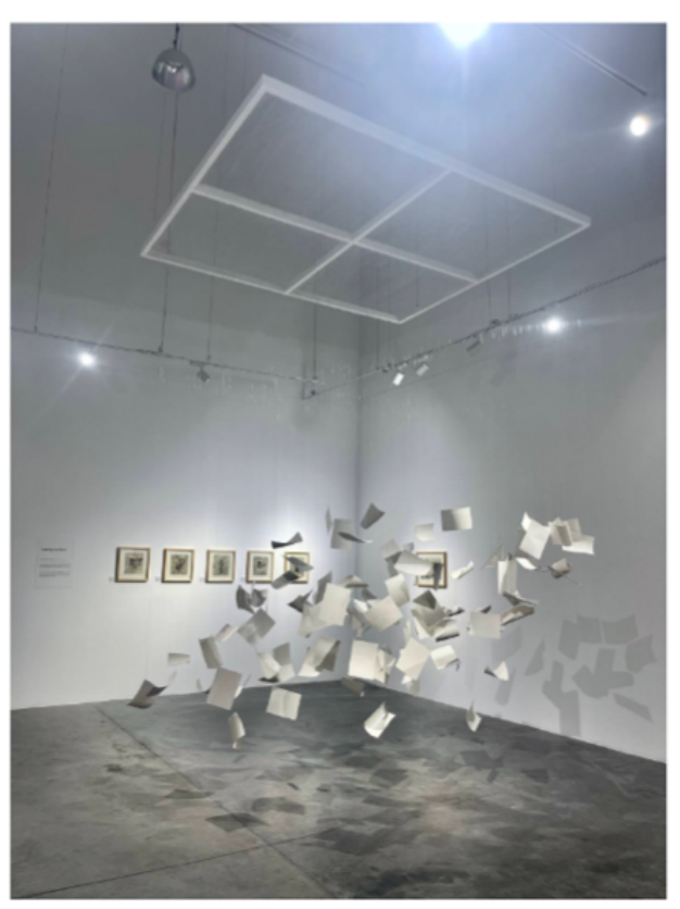
'Leaving is Home' (2022), an installation by Sawsan Al Bahar.

"I knew it was going to become content for my studio. I knew very early on this chapter was the most important, because it's the one that addresses the leaving."