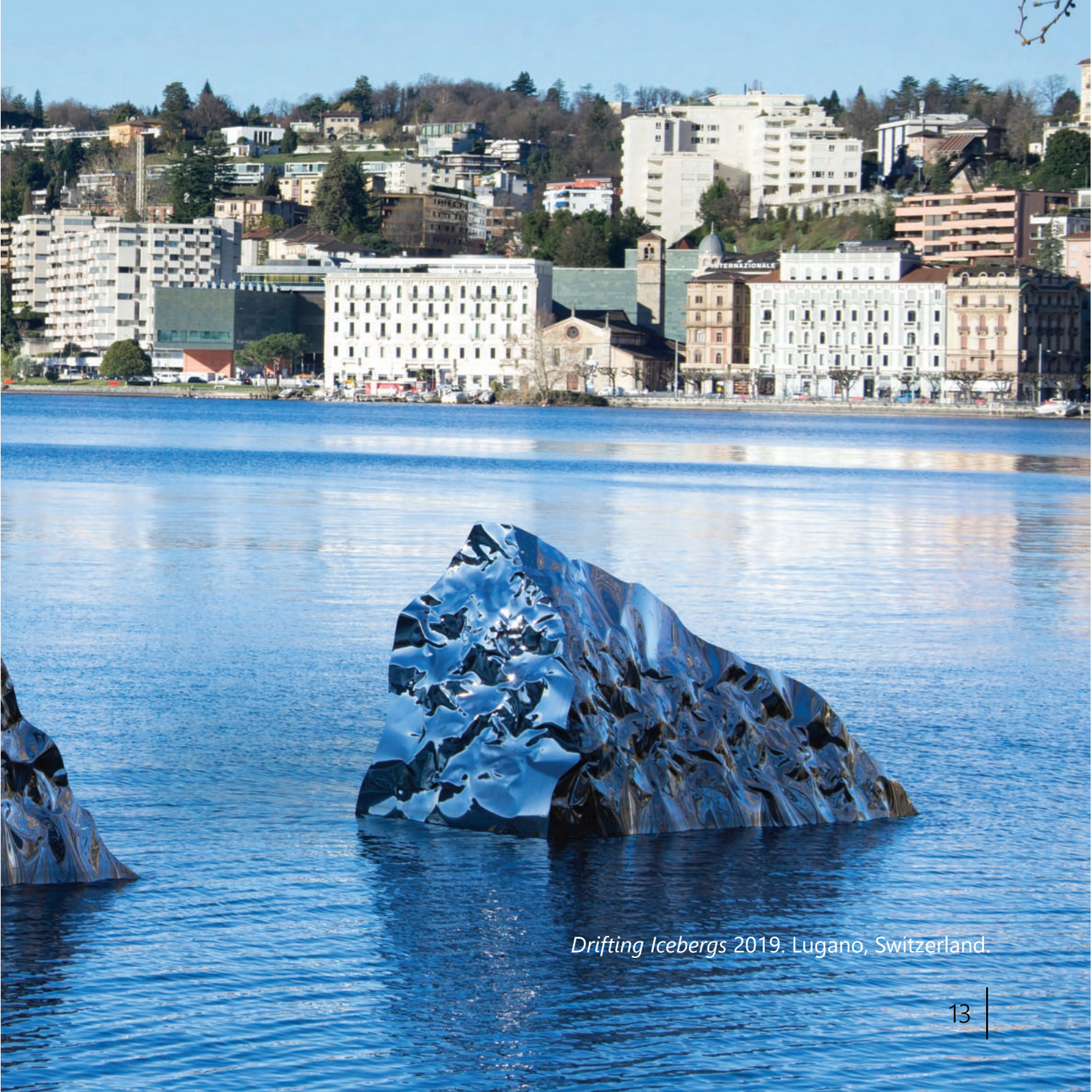
Drifting Icebergs 2019. Lugano, Switzerland.