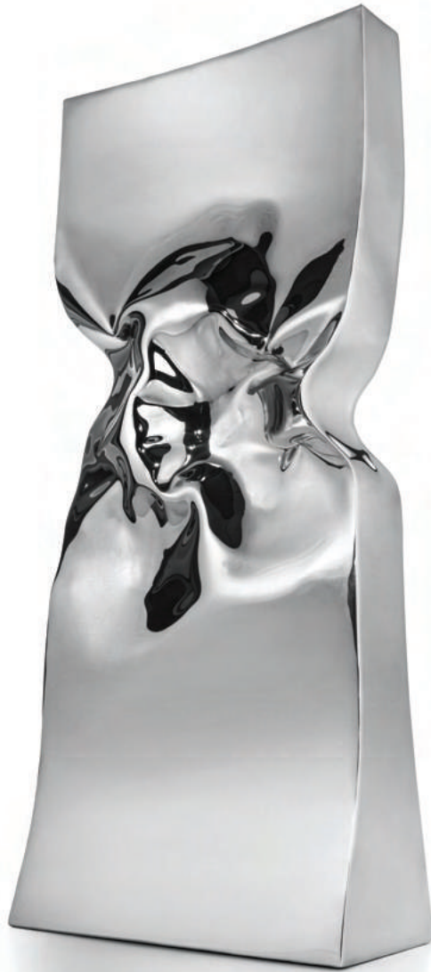
Reflective Energy , 2017, Mirror Polished Stainless Steel, 25,5 x 53,5 x 11 cm