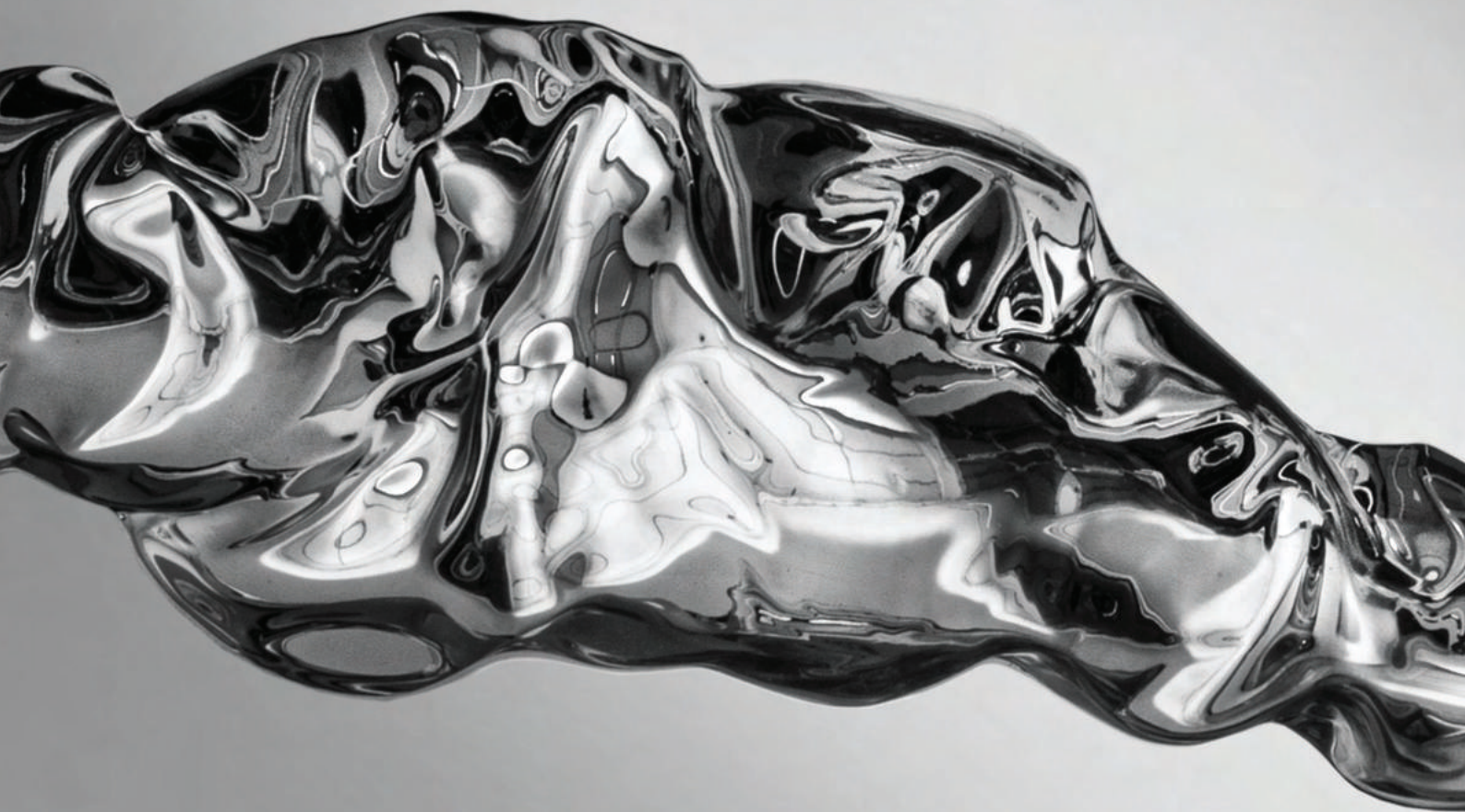
Surface , 2020, Mirror Polished Stainless Steel, 100 x 100 x 20 cm